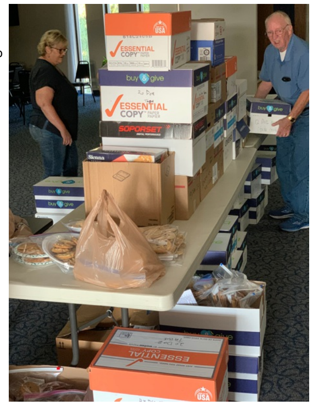
Cookie counting and inspection.