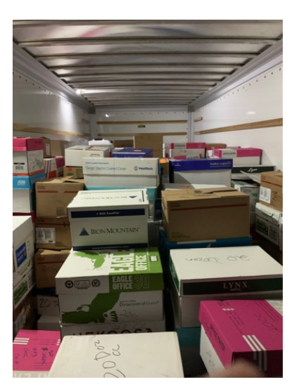
Cookies being trucked into the prison.

The residents who receive the cookies are always amazed that people on the outside would bake for them. These are guys who, in some cases, have no contact with their families. The cookies really provide hope to these guys and open their eyes and ears to the message of the weekend. Your generosity has eternal rewards!